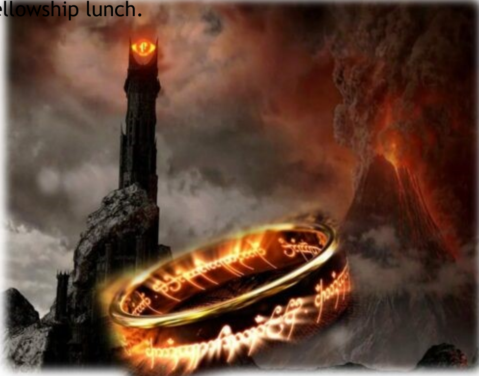
The Lord of the Rings - Johan de Meij